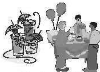
Food and Drinks